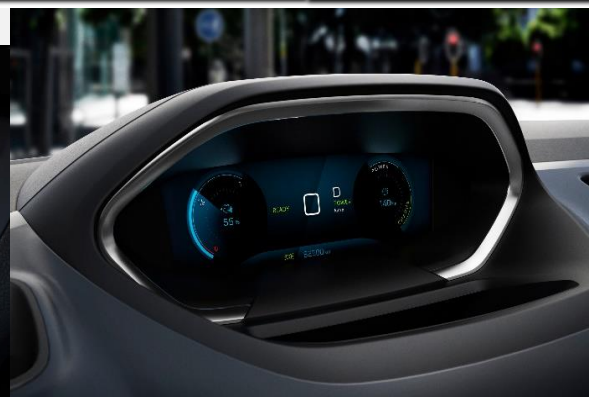
New 10" Digital Instrument Panel