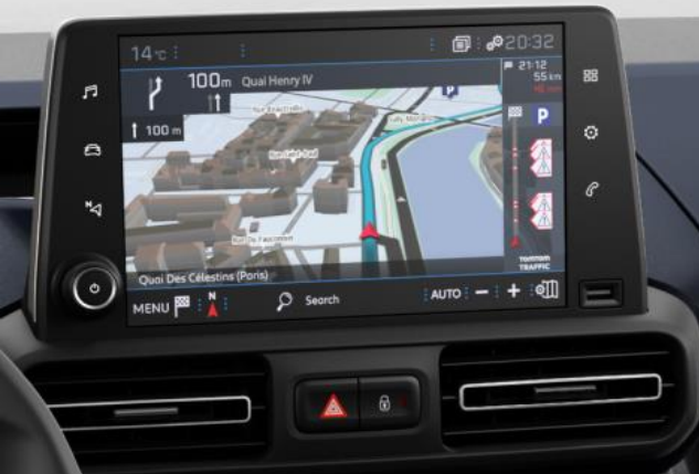
8.0" Capacitive Colour Touchscreen