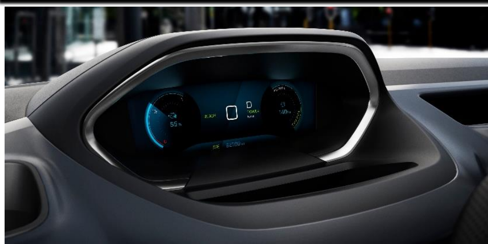
Digital Instrument Panel