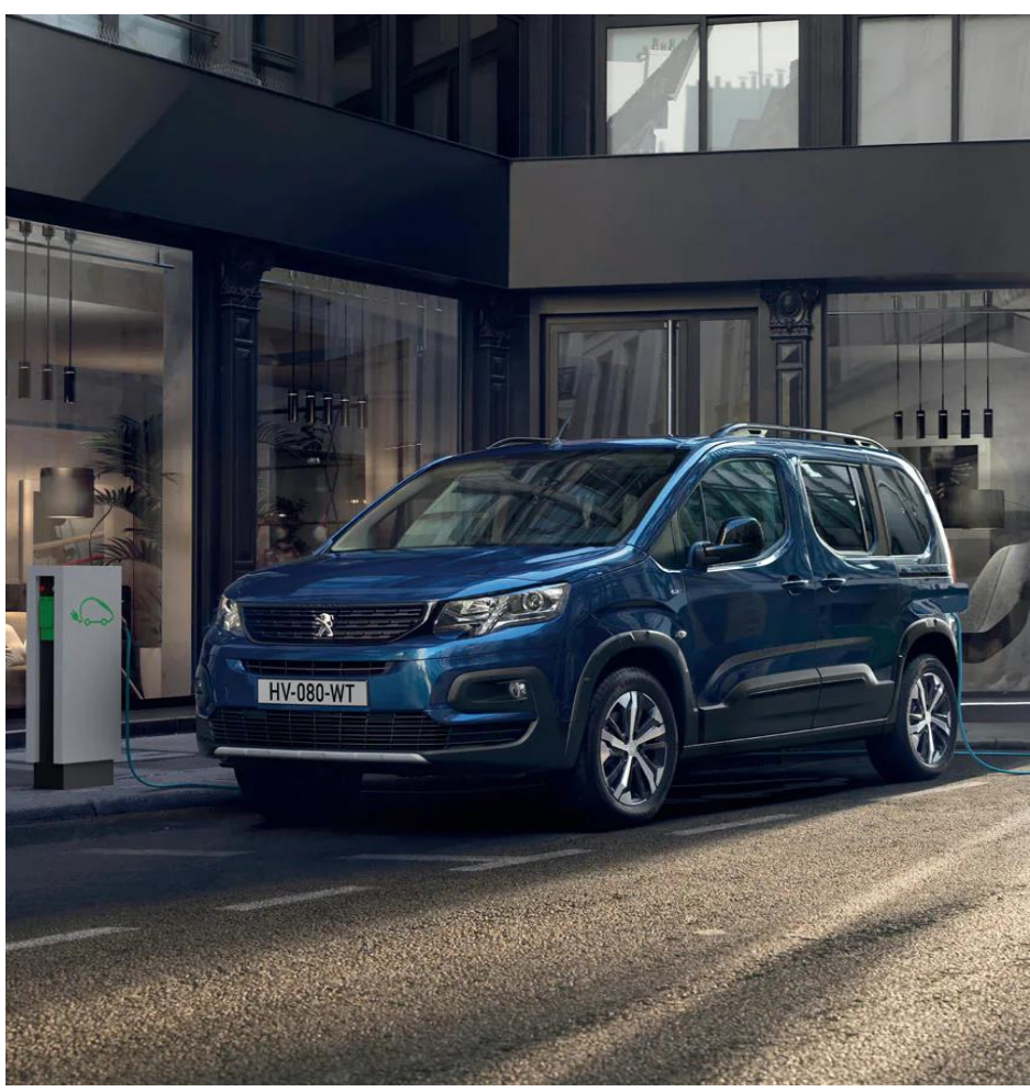
Model shown is PEUGEOT e-Rifter GT with optional Deep Blue paint