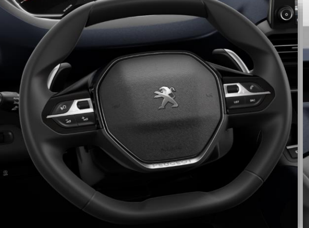
Compact Multifunction Steering Wheel