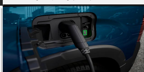
New e-Rifter Charging Capability

All versions of the new PEUGEOT e-Rifter are equipped with the Electric Parking Brake, freeing up floor space.