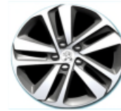
17 inch 'Phoenix' alloy wheel