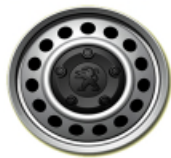
17 inch steel wheel with black centre cap