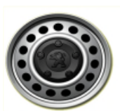
16 inch steel wheel with black centre cap