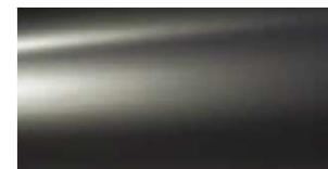
Shark Grey (Metallic)