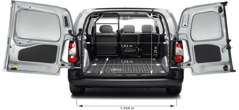
L1 Panel Van