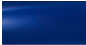
Clipper Blue (Special Point)