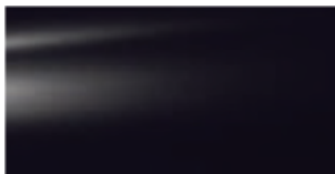
Black (Special Paint)