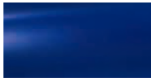
Clipper Blue (Special Point)