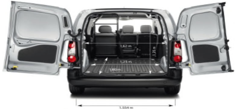
L1 Panel Van