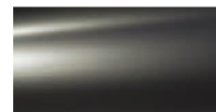
Shark Grey (Metallic)

Please be aware that when requesting Clipper Blue special paint, additional costs will be incurred and lead times will be increased.