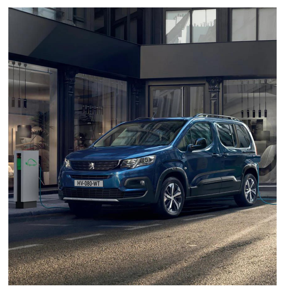
Model shown is PEUGEOT e-Rifter GT with optional Deep Blue paint