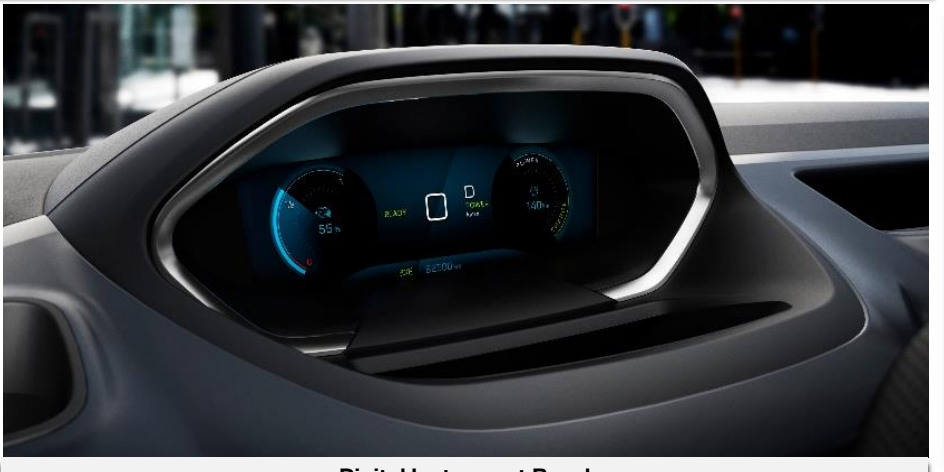
Digital Instrument Panel